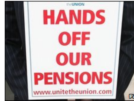
Pension scheme closures have led to protests at some employers

"Those still in defined-benefit schemes have been protected from the recent stock market downturn, but even they are now going to have to live in a world where it is not the employer's problem if the money that was put aside will not buy the pension it was supposed to," he added.