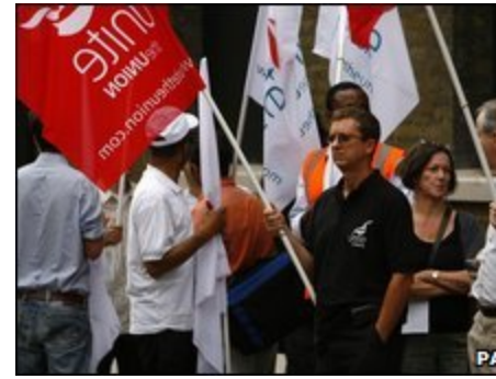
Pension scheme closures have been highly controversial among employees

“ Just under a quarter of the FTSE 100 are now not able to pay their pension deficits over any reasonable timeframe ”